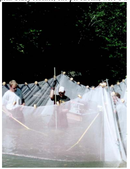
Figure 2. Sampling crew at the Still River electrofishing within a mesohabitat.

Though mesohabitat spacing varies widely in nature, we attempted to sample 25 mesohabitat units within each study system. The geomorphology of each study reach was surveyed in detail using electronic total station surveying, sediment substrate characterization, and microhabitat unit mapping. Hydraulic flow fields were characterized at low and moderate flows using a YSI FlowTracker acoustic doppler velocimeter (ADV). The combined geomorphic and hydraulic data will be used to generate a two-dimesional model of the study reaches using a wellestablished pre-packaged modeling program (River2D). This modeling software, when combined with our statistically-generated mesohabitat definitions (criteria) enable will